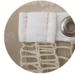
different color thread