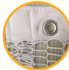
matching thread perfect finished