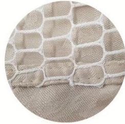
joint not finished well