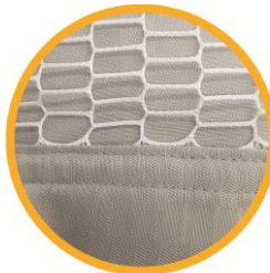
beautifully spaced out and finished