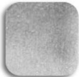
Clear Anodized Aluminum

We are offering the following selections